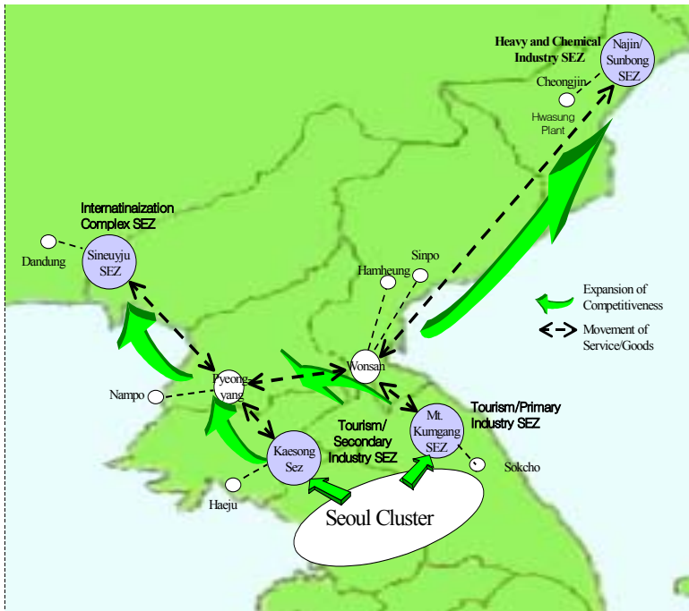
<Diagram III-1> The North Korean SEZ Development Strategy: Specialization and the Procedure of Gradual Expansion